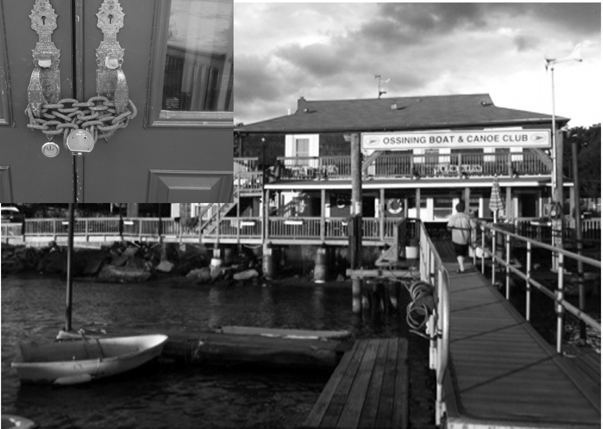
Ossining Boat and Canoe Club bathed in a setting sun

October 3, 2013: I am sitting at a table on the northern end of one of the most iconic properties on the Hudson River: The Ossining Boat and Canoe Club. With me today are the Commodore, Tom Earle, and a number of members who have gathered to