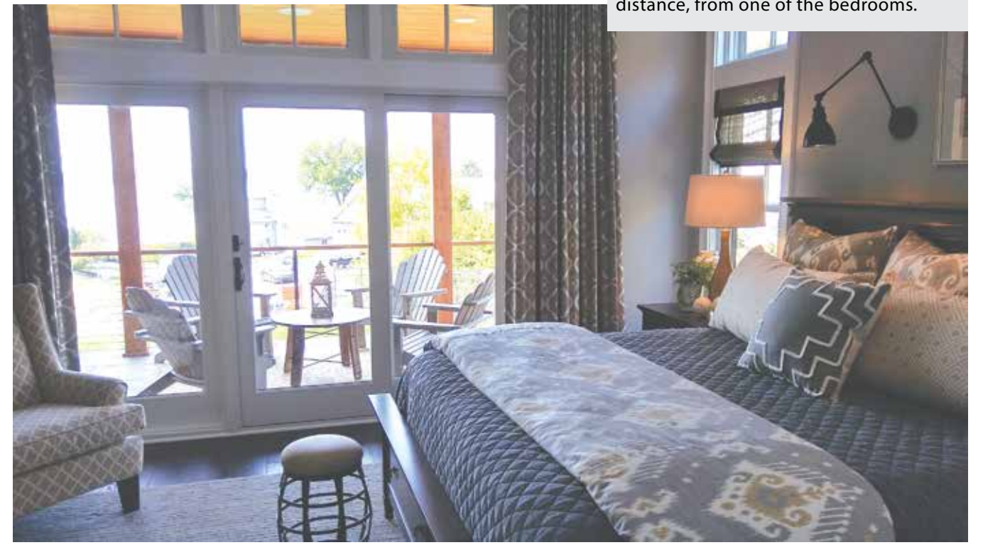
A view that never gets old: Looking out on the covered porch and the Lake in the distance, from one of the bedrooms.