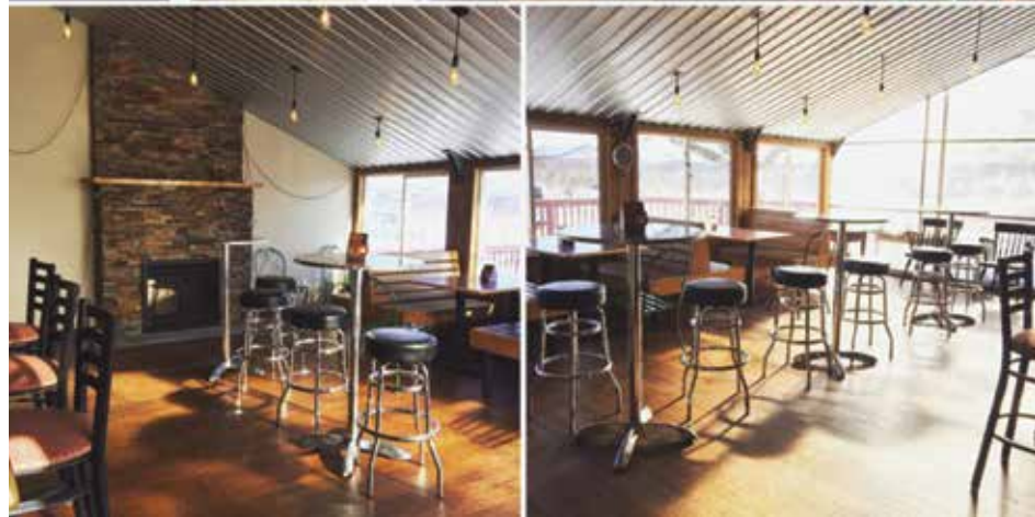
The Tasting Room at Saratoga Apple adds a great new dimension to this venerable farm, with local brews in a comfortable, country setting.