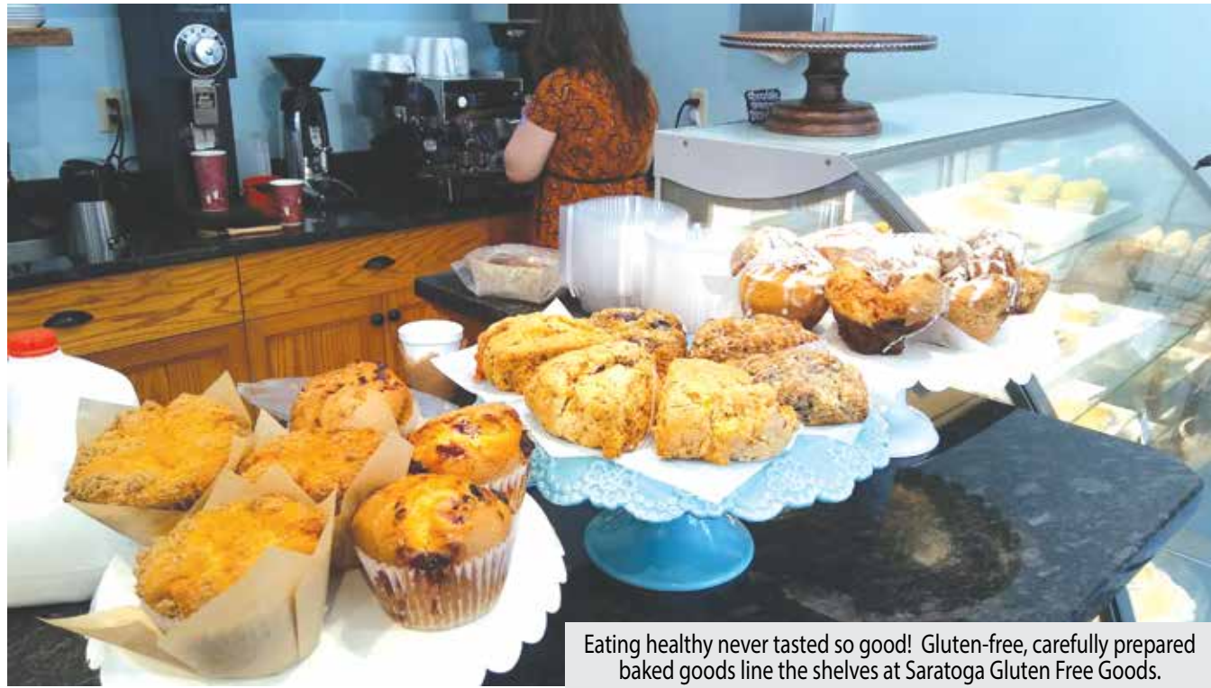
Eating healthy never tasted so good! Gluten-free, carefully prepared baked goods line the shelves at Saratoga Gluten Free Goods.