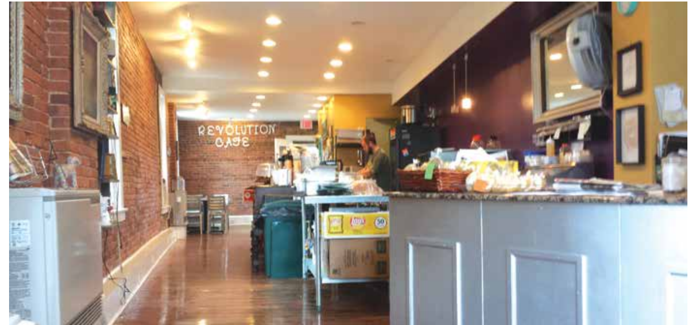
Inside the Revolution Café, a quaint place for breakfast and lunch right across from Fort Hardy Park, the new visitors center (under construction) and just up the street from the Schuyler Yacht Basin.

military veteran and ambitious young entrepreneur, has big plans for the restaurant's future, meanwhile he strives to make everyone's dining experience extra special. Clark's will also be the venue for the Chamber of Southern Saratoga County's special-edition October mixer, Tuesday October 17, 2017 at 5:30PM, the 240th anniversary of Burgoyne's surrender which began just across the street.