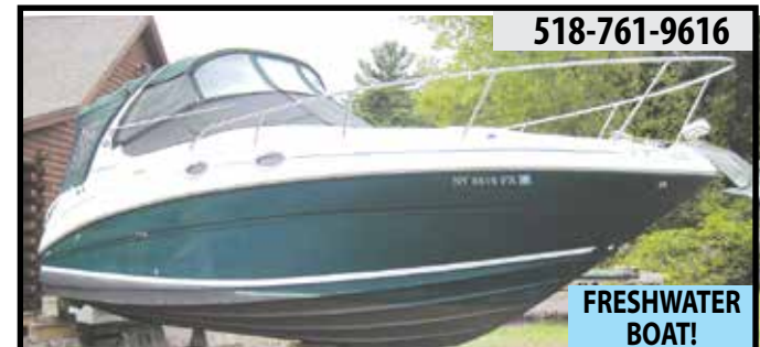
2005 Sea Ray 280 Sundancer $55,000.

With a LOA of 31', and a 9'5" beam, this Sea Ray 280 Sundancer provides plenty of room for the entire family with sleeping accommodations for up to six in the spacious forward, mid, & aft-cabins, and it comes with all of the amenities of home, and then some! Air conditioning? Heat? Hot water? Generator? Windlass? Yes, they're all here, and so much more! Not only that, with only 280 fresh water hours on the engines and 125 hours, on the generator...this boat is barely broken in!