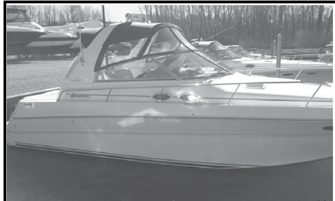
2001 SeaRay Sundancer 31 31 feet, Motor 2001, Horizon 600 HP/Bow thruster/ Generator / Bimini top /Winterized/Shrink wrapped in Waterloo. 52K or make offer. 518-295-7779