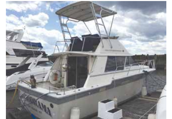
1988 Silverton 34C, Mint Condition, twin 350/270 Crusaders engines, Starboard engine replaced last week (Vortex). New engine has a three yr. warranty, Current owner for past 15 yrs., Includes windlass, stove, microwave, GPS, AC, Gen, sleeps 6, Brand New Atlantic Tower, Can be seen at Half Moon Bay Marina, Call 382 2505 $28,000 OBO. 3

35' deep-water dockminium available at Half Moon Bay Marina. Features easy in and out (4th slip from entrance). Within walking distance from Croton-Harmon train station. Asking $80,000. Why rent when you can own in beautiful Croton Bay! Call Peter at 914-260-2314 or Andrea at 914-659-5026.