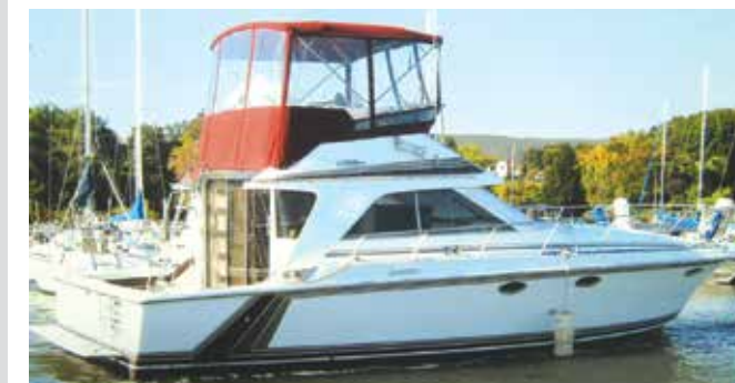
Beautiful 37' foot Trojan International, Flybridge, Twin 454 hp, 400 hrs., 2 reverse cycle air AC, sleeps 6. 6.5 generator, many extras, in Verplanck, NY, in water demo available, $19,900, cell: 914-474-2184. email: clericic@aol.com