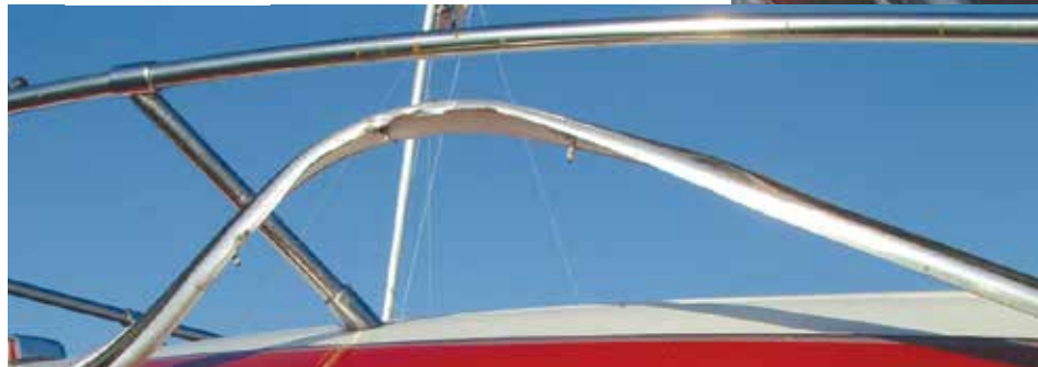
Damage from a post on a dock - before ...