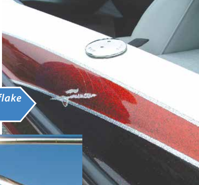
"Multi-color" Polyflake on a bass boat