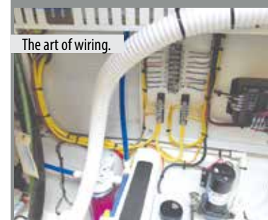
The art of wiring.