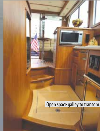
Open space galley to transom.