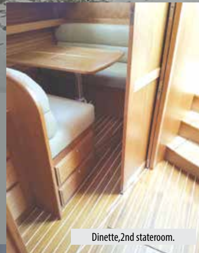
Dinette, 2nd stateroom.