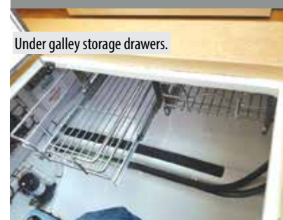
Under galley storage drawers.