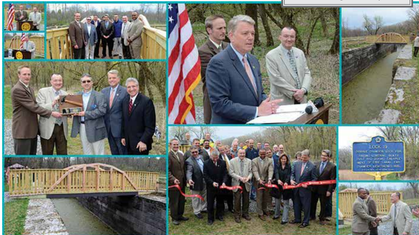
This collage of photos was produced to commemorate the 2012-'13 renovation and bridge construction project that saved Historic Lock 19 and was recognized with a major collaborative volunteerism award.