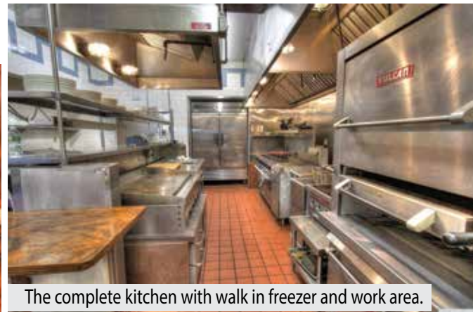
The complete kitchen with walk in freezer and work area.