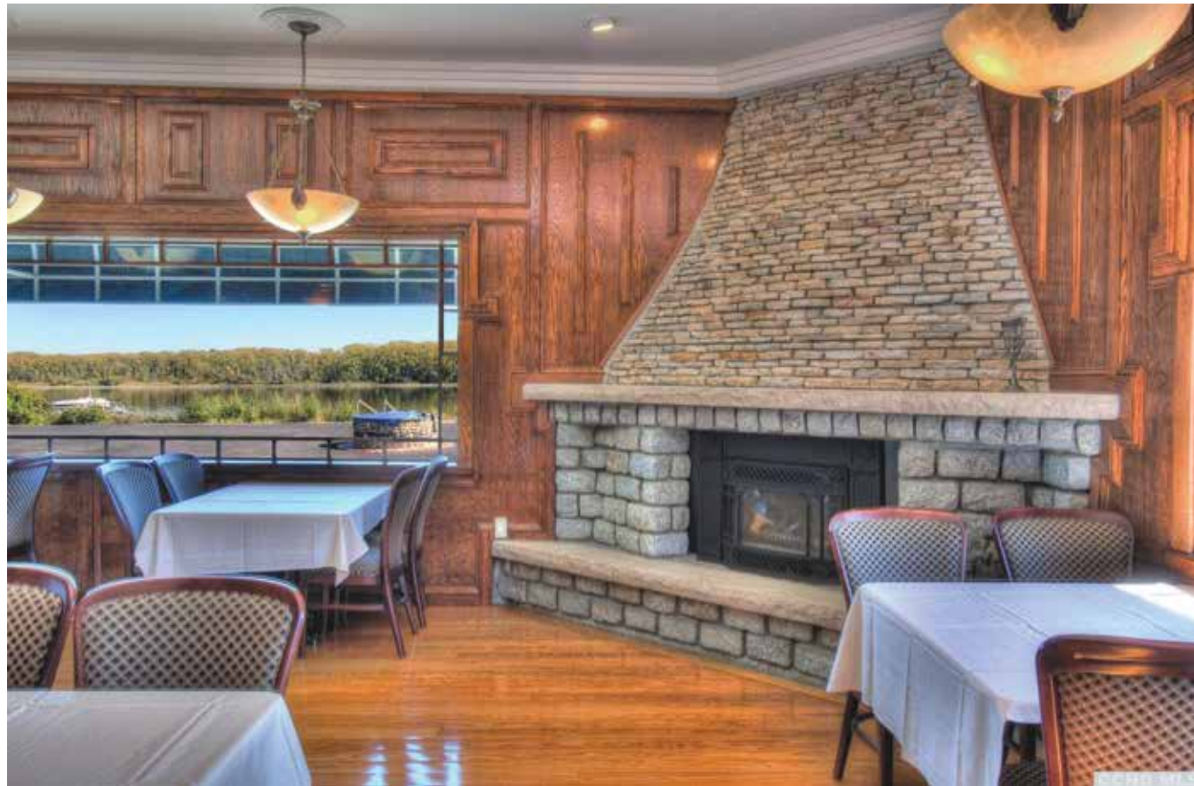
On a cold winters night, dining here with the warming fireplace, this can be an unforgettable experience.