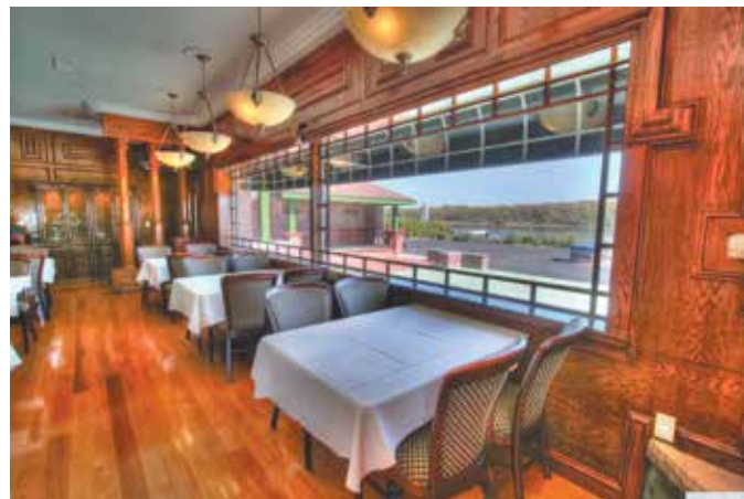
Another look at the main dining area.