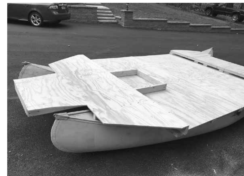
Dallas at work on a raft.