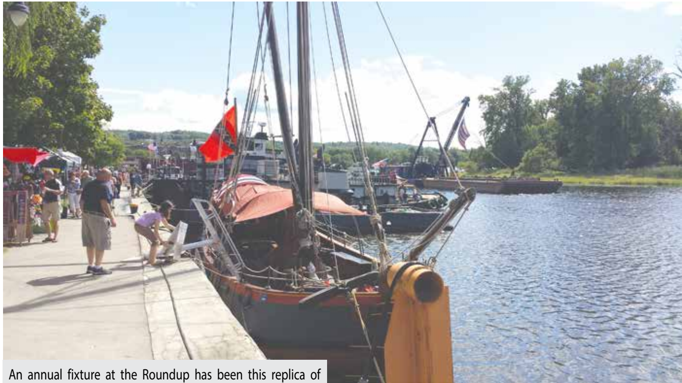
An annual fixture at the Roundup has been this replica of the first-ever cargo ship built in New York State, the 1614 Onrust. This year, the vessel has spent more time downstate in collaborative efforts with the Hudson River Maritime Museum, the Connecticut River Museum, Marist College, and later this fall, the Bronx Museum/Greene County Historical Society, Crailo State Historic Site and Albany County Visitor Center.