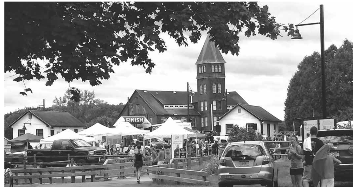
Last year was the first annual Tugboat Chug 5k, a great event held right along the historic canals and downtown Waterford. There will be a kids fun run directly following the 5k, plus prizes for top finishers and all the kids!

The Tugboat Roundup is inspirational because it not only shows us the vessels of the past, but also those of the present and future. Last year, moored behind the replica of the 17th Century Onrust were several boats of the New York State Marine Highway's fleet. These tugs move some 90 percent of the products shipped on the canal system each year and almost all of the freight which is transported on the Champlain Canal. These vessels are specifically designed to handle the unique demands of the canals – some even have telescoping pilothouses to duck under bridges in a 21st century version of "Low