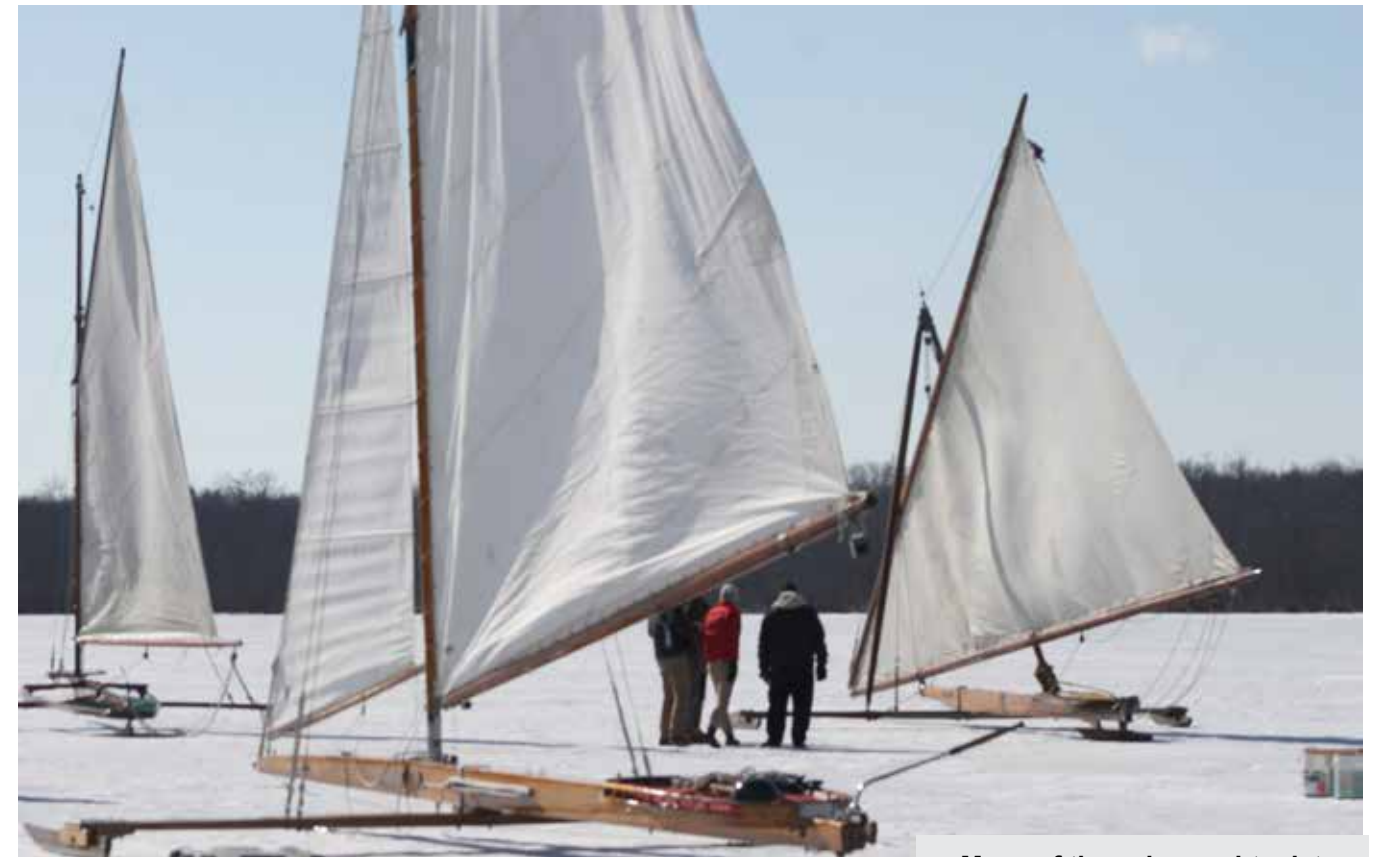
Many of these ice yachts date back to the 19th century.