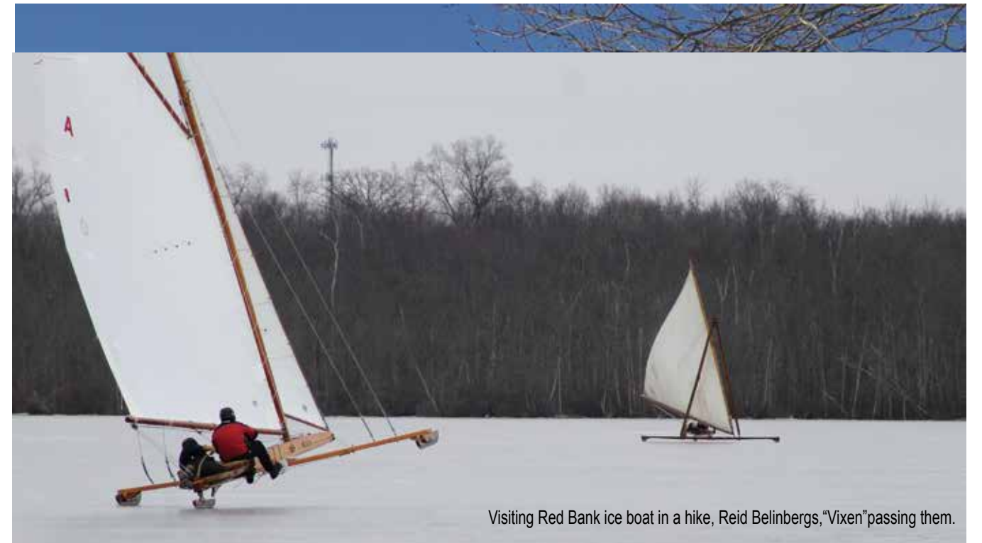
Visiting Red Bank ice boat in a hike, Reid Belinbergs, "Vixen" passing them.