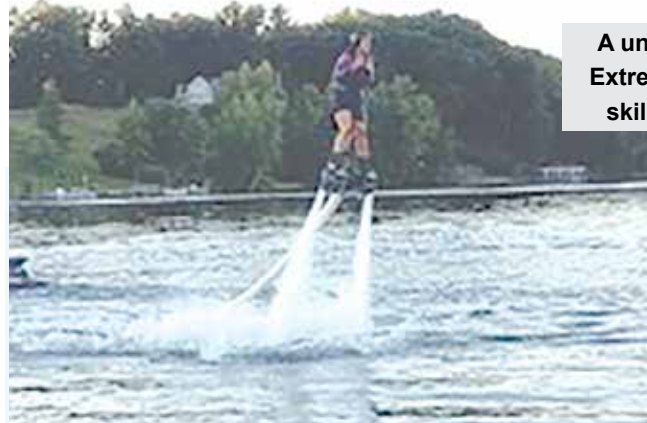
A unique sport will be on display as Extreme Hydroflight showcases their skills at this year's Canal Festival.