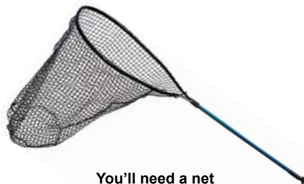
You'll need a net to get the fish into the boat.