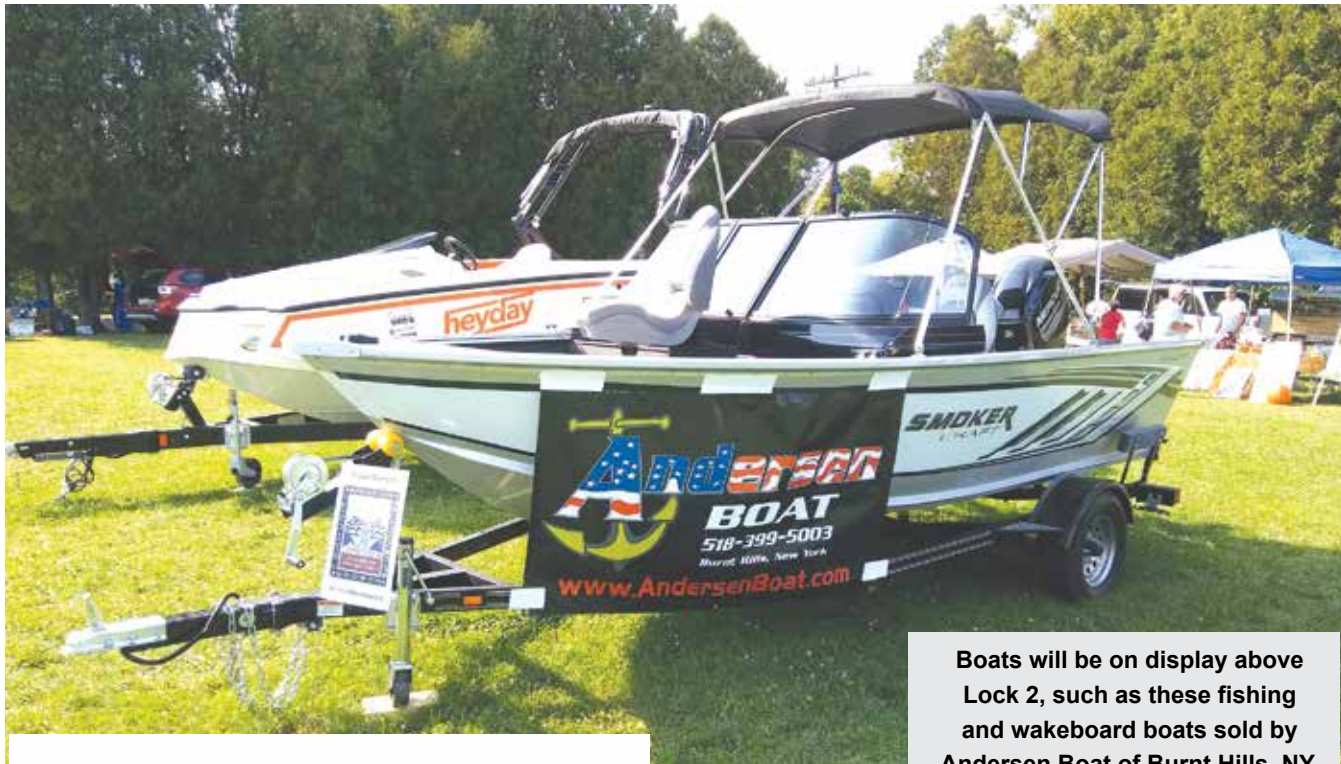
Boats will be on display above Lock 2, such as these fishing and wakeboard boats sold by Andersen Boat of Burnt Hills, NY.