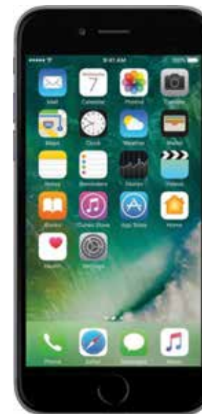
Always take your phone in case of an emergency.

Pack away a tape measure even if you just size up a six inch sunny and be sure to have a net at the ready for not only fish but maybe the extra joy of frog and turtle bonus "catches" that can salvage a fishless day into a treasure of alternative biological wonders. If you use a light, long handled net with very tight mesh, the kids can also catch butterflies or moths, snag crickets and grasshoppers for bait and turn this part of the day into one of the most enjoyable activities they are actively doing themselves