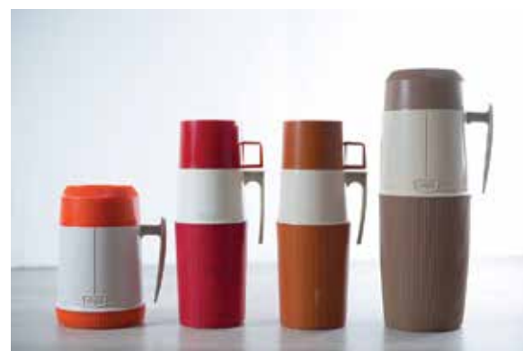
Hot chocolate for chilly days.