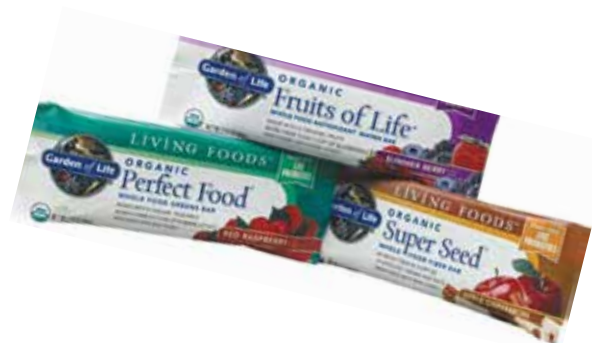
Kids want snacks.

More basic essentials include a lunch or bunch of preferred snacks (food bars or fruit) depending on the duration of the trip, plus plenty of liquids that the child likes. In the hot summer a Gator Aid electrolyte replacing type drink is great, while in cold weather a thermos of hot chocolate might be the perfect choice. It's vital that little kids be hydrated; especially when they are excited and distracted with energizing angling activities that make them perspire and burn up so much energy.