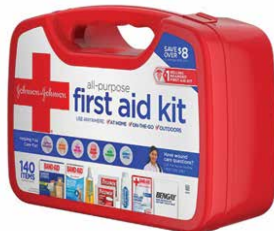
Someone's going to get hooked.

Pack away a tape measure even if you just size up a six inch sunny and be sure to have a net at the ready for not only fish but maybe the extra joy of frog and turtle bonus "catches" that can salvage a fishless day into a treasure of alternative biological wonders. If you use a light, long handled net with very tight mesh, the kids can also catch butterflies or moths, snag crickets and grasshoppers for bait and turn this part of the day into one of the most enjoyable activities they are actively doing themselves