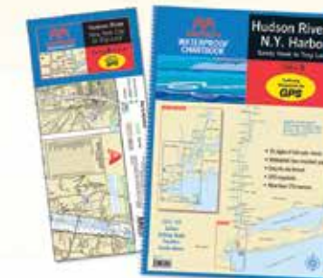
Maptech Waterproof Charts and Chartbooks Waterproof pages perfect for use in any weather. Chartbooks include GPS waypoints and locations of marinas, restaurants, fuel and boat ramps.