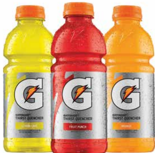
Bring lots to drink.

license and rulebook for the involved adults so they know exactly what they can and can't do in the state they are angling in. Buy the year long choice because it's the best bang for your buck and supports the state hatchery programs and other worthy aspects of the stocking programs. Bring along both your cell phone and camera or video back-up for unforgettable irreplaceable mementoes of your child's first catch, a screaming face holding a squirming worm, or a deep grateful hug from the happiest kid in the world!