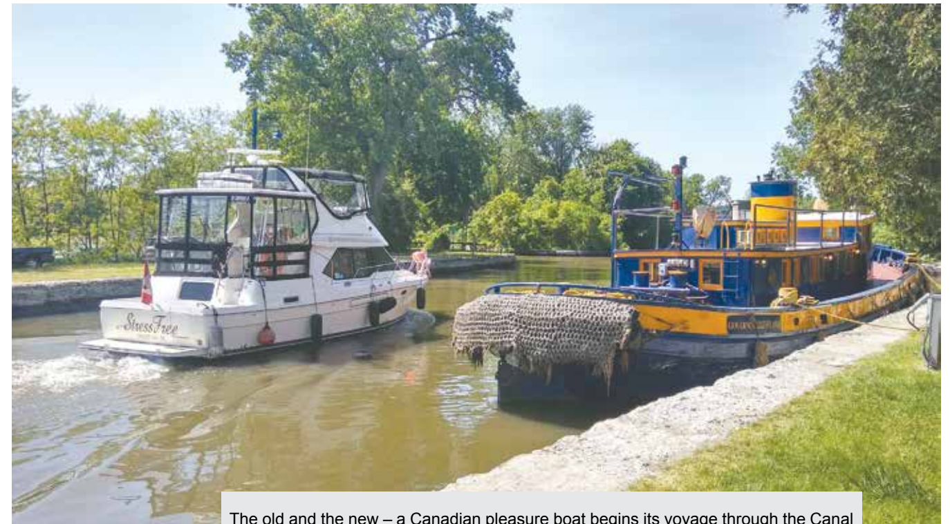
The old and the new – a Canadian pleasure boat begins its voyage through the Canal System above Lock E-2, passing the NYS Canal Corporation tug "Governor Cleveland". Originally a steam-powered ice-breaking tug, the "Cleveland" with her diesel engine is a mainstay among the working fleet used to maintain our inland waterway.