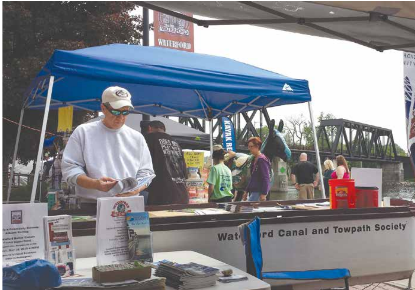
Captured in this photo are many of the things you will see at the Waterford Canal Festival on May 19: canal barge replicas, mules, local information, food, kayaks, history, heritage and of course, the water. The Chamber of Southern Saratoga County will be hosting the Canal Festival in partnership with the Village of Waterford. Both Chamber and Village are proud supporters of the Town of Waterford's Steamboat Meet (July) and Tugboat Roundup (September).