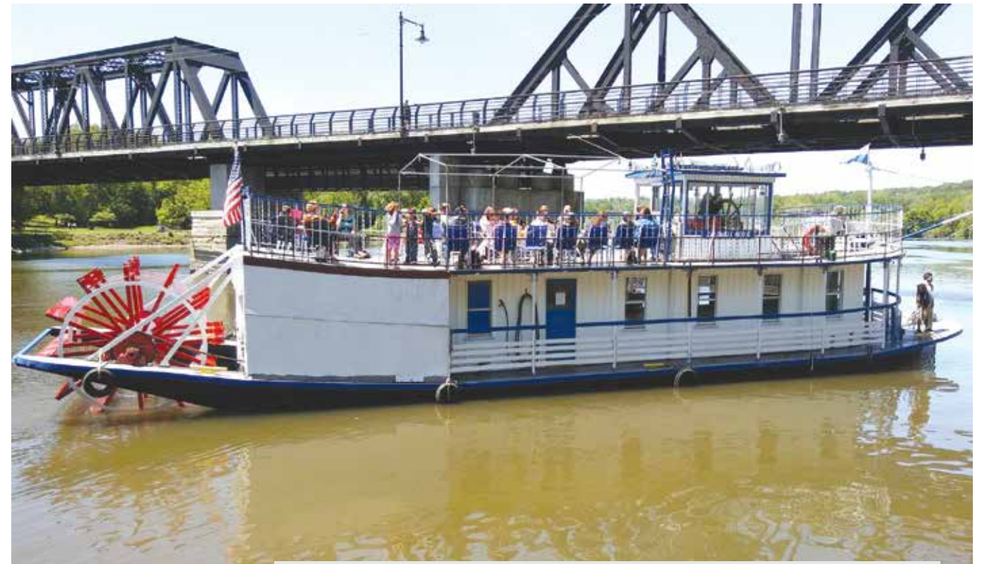
The paddle wheeler “Caldwell Belle” is indicative of the type of interesting tour boats available to canal visitors. Normally based in Schuylerville near Lock C-5, the “Belle” and her companion, the “Mohawk Maiden”, will be mainstays at Waterford events in May, July and September. Visit www.mohawkmaidencruises.com for more information.