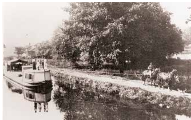
Ohio Erie Canal in Independence, OH (Circa 1902)

Use the off season to your advantage and plan your next canal voyage! For more information please visit www.nycanals.com , www.southernsarotoga.org or stop by the Southern Sarotoga Information Center on the I-87 Northway between Exits 9 and 10 in Clifton Park.