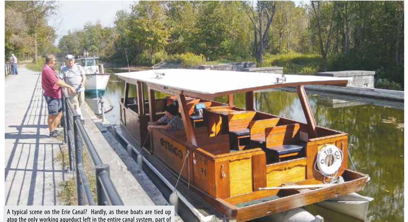
A typical scene on the Erie Canal? Hardly, as these boats are tied up atop the only working aqueduct left in the entire canal system, part of an historical exhibit at the Nine Mile Creek Aqueduct in Camillus, NY.