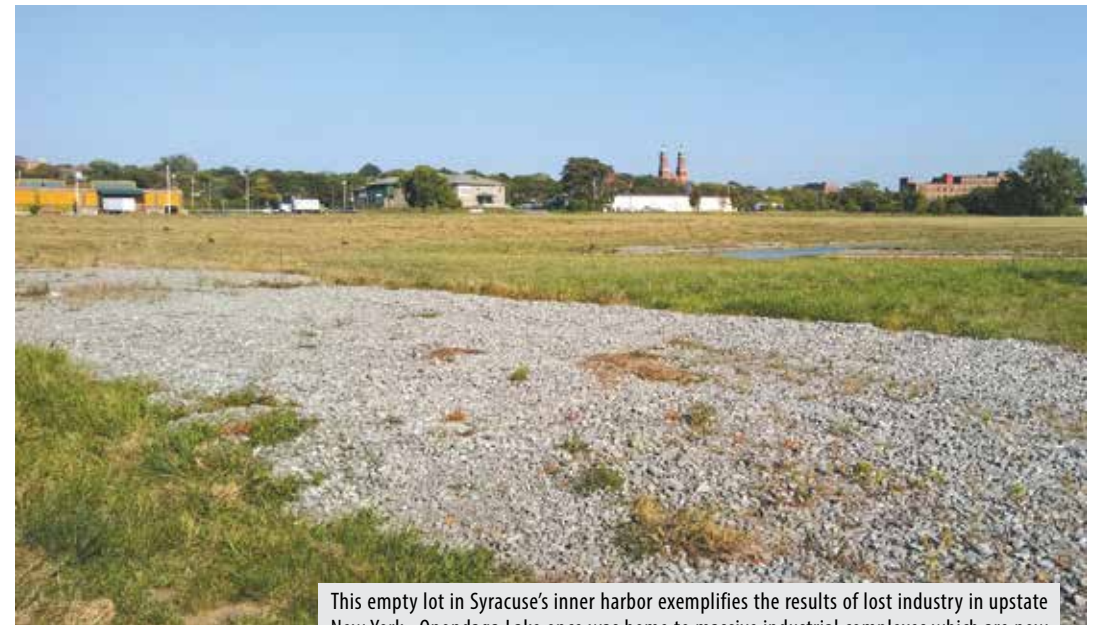
This empty lot in Syracuse's inner harbor exemplifies the results of lost industry in upstate New York. Onondaga Lake once was home to massive industrial complexes which are now gone. Once extremely polluted, the Lake has been restored ecologically and the adjacent land is now available for imaginative new projects

The Canal changed a lot over the years, being widened in the 1840s, having locks enlarged in the 1880s, and finally being completely replaced by the "modern" Barge Canal (now the New York State Canal System) in 1918. Scheduled in 2018 are commemorative events, ceremonies and initiatives which will provide educational, historical and fun experiences for boaters and landlubbers alike. These activities will feature tourism, industry and other pursuits (see the Corning Glass Barge story in this issue for example) by utilizing chambers of commerce, state, regional and county tourism agencies as well as local groups to promote the Canal System locally, nationally and even to international visitors.