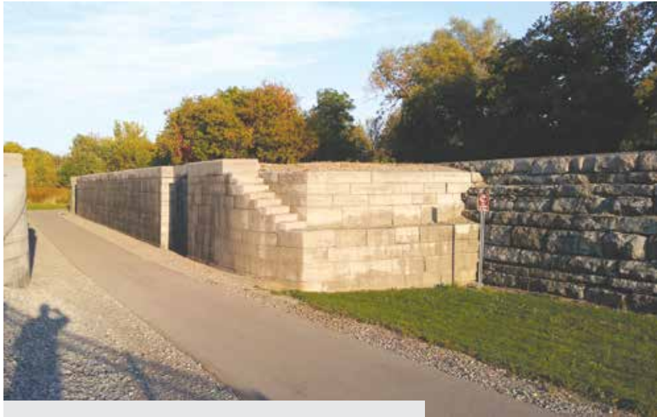
This historic lock in Port Byron is accessible right off the New York State Thruway, a first-of-its-kind exhibit in the state. Motorists can stop, enjoy the visitors center and canal exhibits, and then conveniently re-enter I-90, all without passing through any toll booths.

transportation systems. Hudson Valley residents and boaters are close to an amazingly complex and interesting system which is often overlooked on canal journeys – if you take the time to plan and explore it!